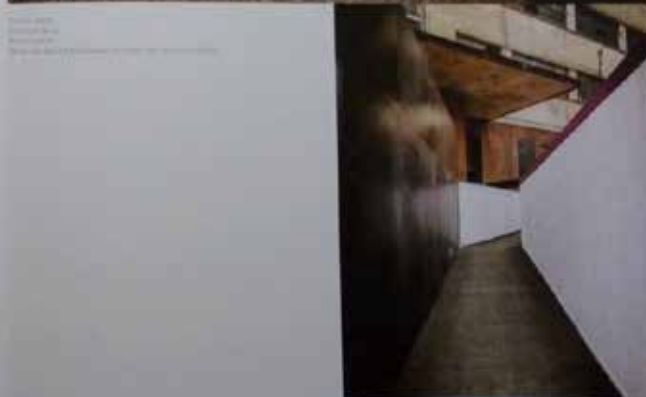
Reinforcing glass facade Flooring (Lauria Studio)